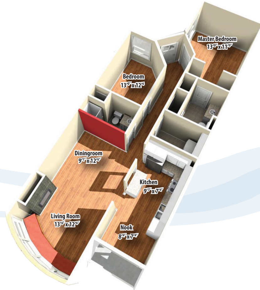
Main Floor 1,086 Square Feet